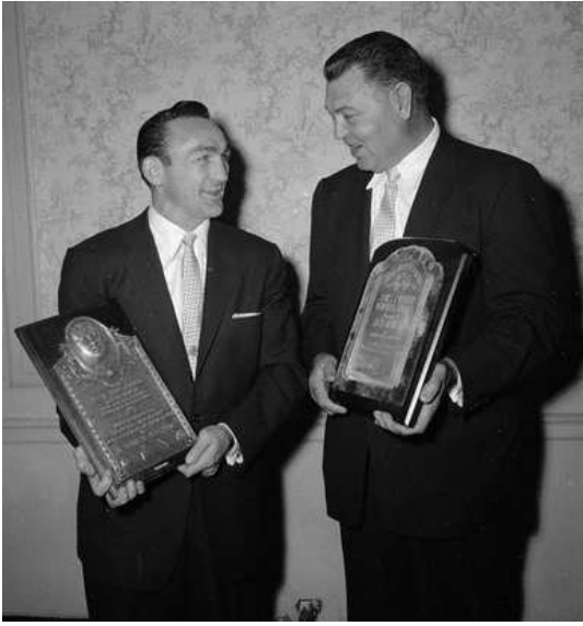
Carmen Basilio and Jack Dempsey, 1958