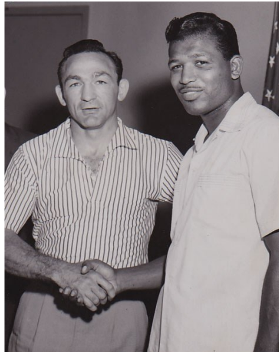
Mr. Basilio and Sugar Ray Robinson 1957